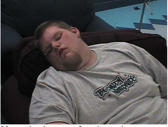
Man, the lounge furniture is so...... Comfortable.

In the jungle, the mighty jungle, the lion sleeps tonight.