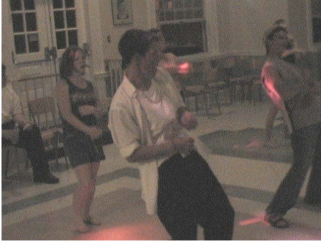
And! Oh, how they watched!