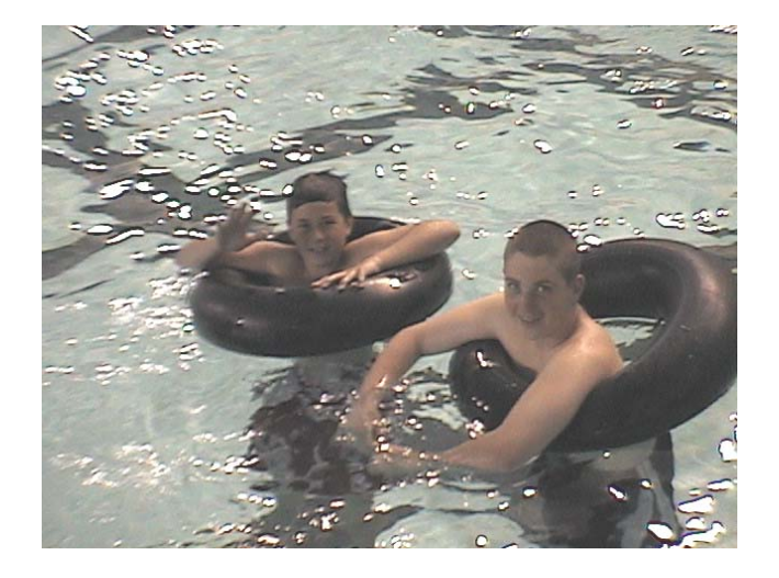
3) Can you figure out which DeMolay swam the extra length?

3) Dude! Has anyone seen the other tires from my car?