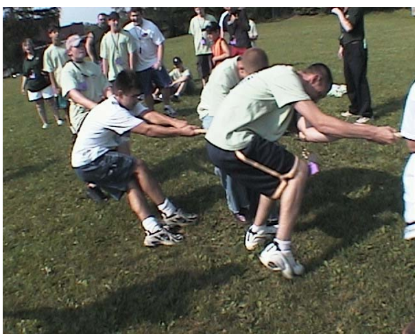
From this picture, it's hard to say whether they're pushing or pulling. But there was definitely a lot of effort being generated.